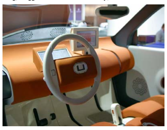
Figure 1: Picture showing the actual vehicle interior with the GUI display mounted on the dashboard.

(GUI) with a haptic (reactive touch screen) interface. The GUI augments the speech interface by providing the user with additional information such as indications on the state of the dialog, suggestions on what to say, and feedback on the