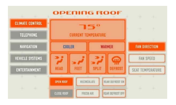
Figure 2 : Screenshot of one of the GUI displays the example of Figure 2.

vehicle gauges, switch the system voice on and off, and change to a different voice. Each subsystem corresponds to a different layout of the GUI, with appropriate widgets designed for controlling the corresponding functionality, as in